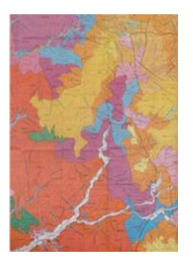
View the map record